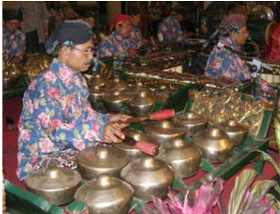
A gamelan player playing bonang. Gamelan Yogyakarta style during a Javanese wedding in Taman Mini Indonesia Indah.