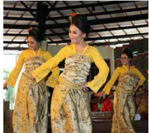
The Sundanese Jaipongan Mojang Priangan dance performance in West Java Pavilion, Taman Mini Indonesia Indah, Jakarta.